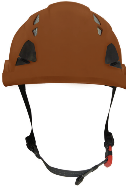
(Front with Chin Strap)