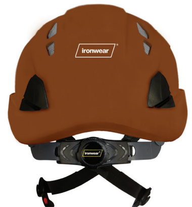
(Back with Ratchet)